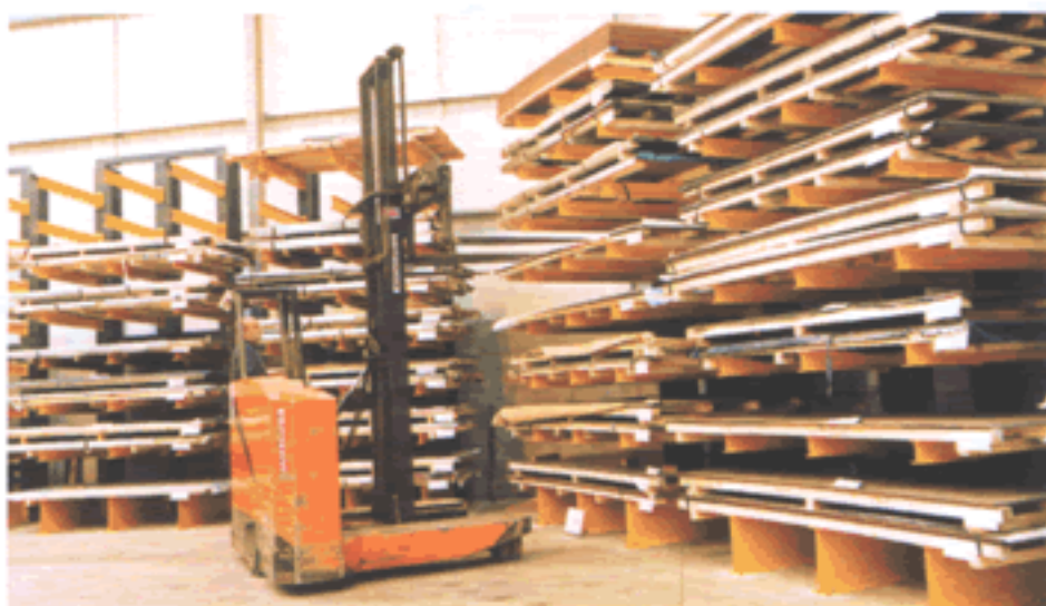
The custom built storage facilities for stainless steel stock