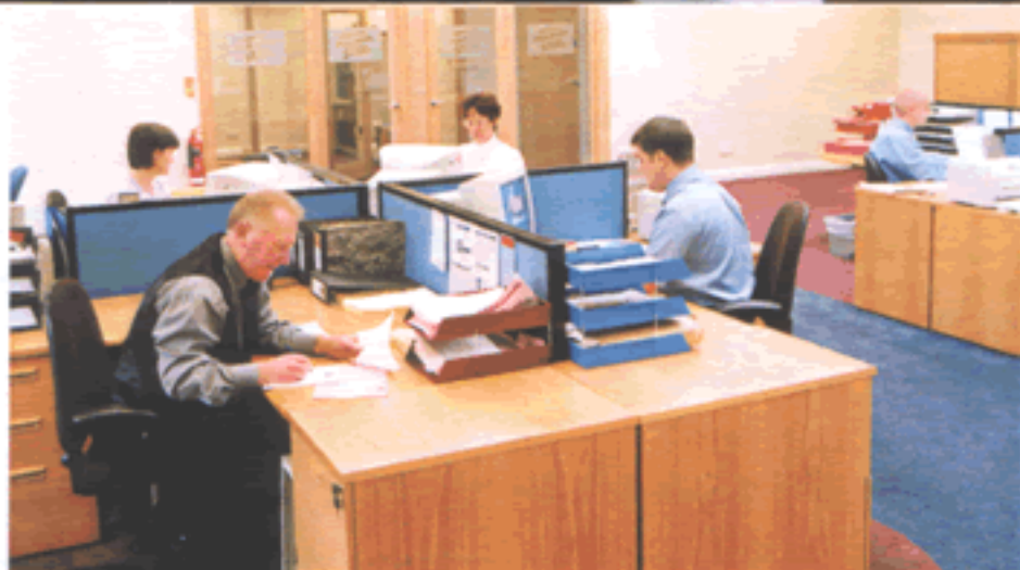
Spacious, light and modern - the ideal working environment

Details of our new name, address, telephone and fax numbers and how to find us are shown overleaf.